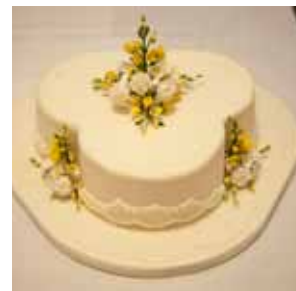
DECORATED CELEBRATION CAKE